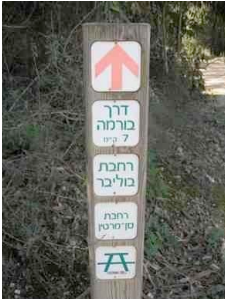
Figure 7.1 – Signpost for the Bolivar & San Martin courts in Eshta'ol Forest

San Martin; they stand on the land of Beit Mahsir. A number of other sites are reportedly named after the country of Venezuela (13).