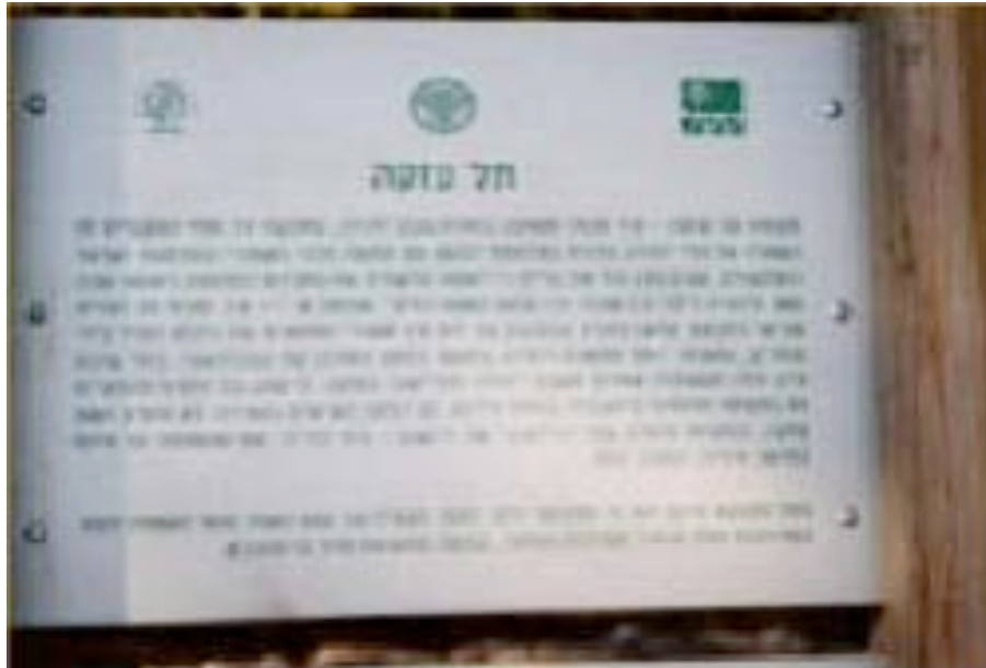
Figure 3.3 – Signpost for the ruins of Tel Azeqah in the British Park

An additional reference to the settlement of Beit Zecharia appears in the official signpost for the ruins of the fortress city of 'Tel Azeqah', decorated with three official logos – the JNF, the Antiquities Authority, and the Society for the Protection of Nature (Figure 3.3).