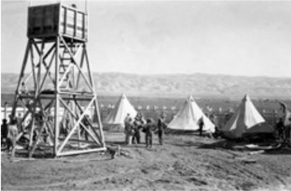
Figure 2.1 – Early Zionist watchtower