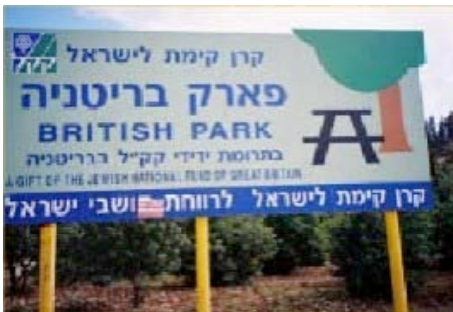
Figure 3.1 – Signpost at the entrance of the British Park

The signpost at the entrance of the British Park (see Figure 3.1) proclaims the park as “a gift of the Jewish National Fund of Great Britain”.