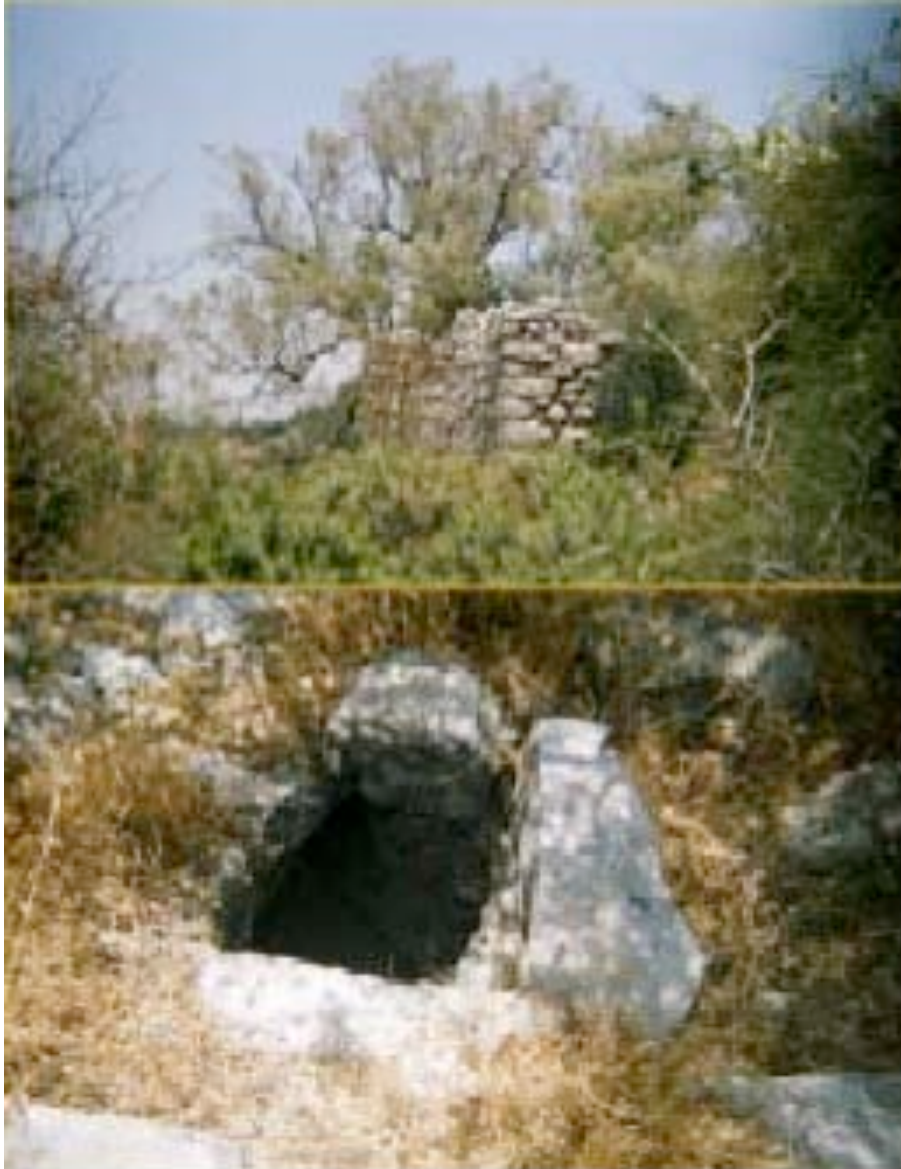
Figure 3.2 – Remains of the Palestinian village of Ajjur

Prior to the ethnic cleansing of 1948, Ajjur was one of the larger Arab rural localities in the country. Today, the indigenous Palestinian people of Ajjur are stateless refugees, living mostly outside the 1949 armistice line (the so-called Green Line) in Dheisha and Arrub refugee camps, south of Bethlehem.